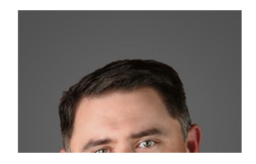
Small Texas credit unions launch CUSO to give other small CUs a boost