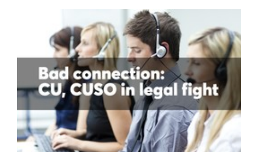
In suing PSCU, credit union alleges 'significant reputational harm'