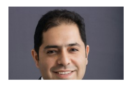
2 more credit unions invest in CU Rise Analytics CUSO